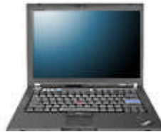
PC with Video Conferencing