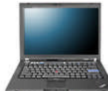
PC with Video Conferencing